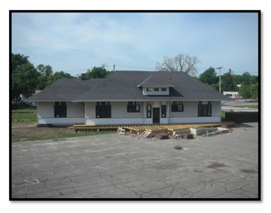
Pictured is the Depot in its present location at the Porter County Career and Tech Center. The deck being built by our students can be seen in the foreground.

ArcelorMittal has stepped forward to join our community and students in supporting the repurposing of the 1912 Grand Trunk Railroad station with a generous donation of $50,000.