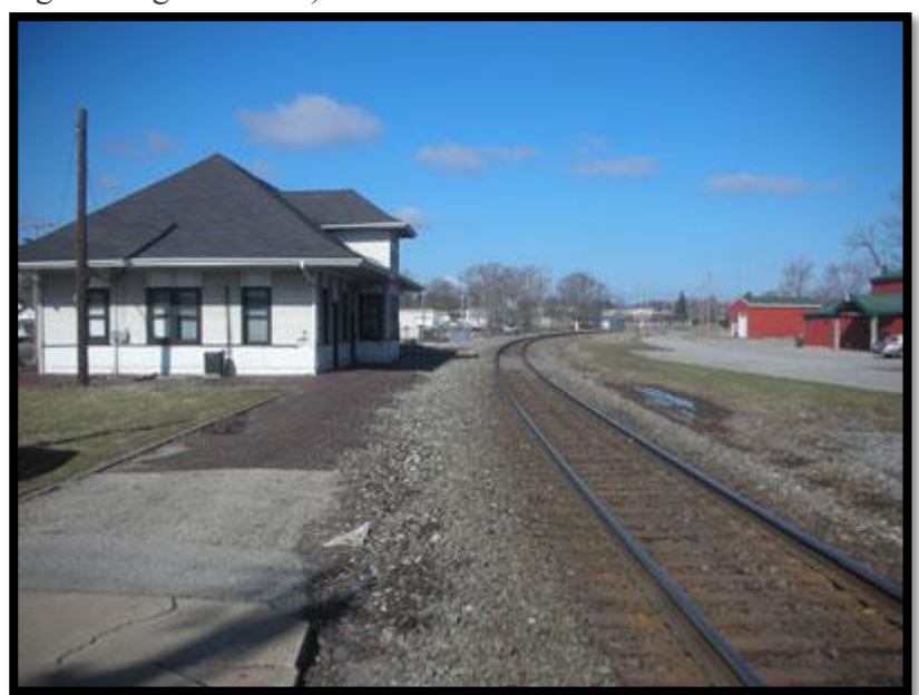
Former Location of the 1912 Grand Trunk Passenger Terminal

them with a sense of ownership of the project while also utilizing their STEM (science, technology, engineering and math) skills."